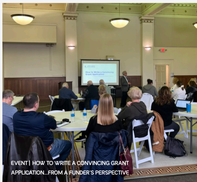
EVENT | HOW TO WRITE A CONVINCING GRANT APPLICATION...FROM A FUNDER'S PERSPECTIVE